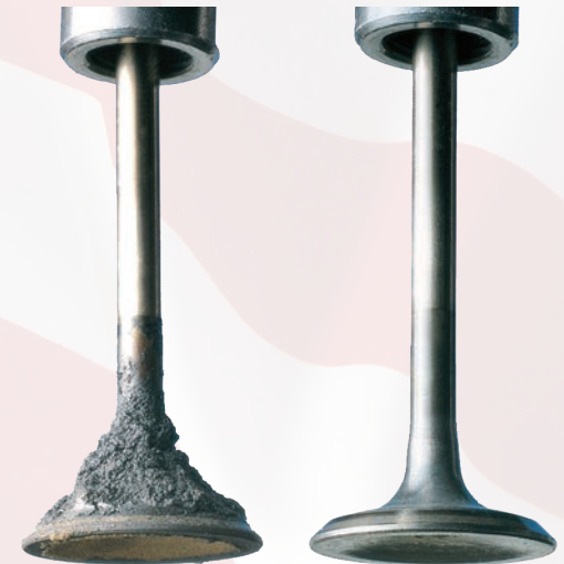
INTAKE VALVE BEFORE

Gasoline engines generate power by pre-mixing injected fuel and air and then igniting the mixture with precision timing. Over time, the fuel injectors become clogged with deposits of fuel impurities and accumulated carbon deposits. Thus, cleaning is vital for maintaining normal Fuel economy & performance